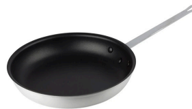
14" Aluminum Non-Stick Fry Pan