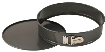
12" Springform Pan