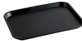
10" x 14" Black Fast Food Tray