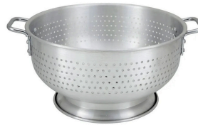
16qt Aluminum Colander