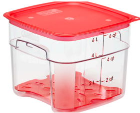
6 Qt Square Food Storage Container