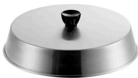
10" Round Aluminum Basting Cover