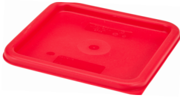
Square Lid for 6 or 8 Qt Container