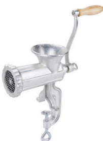
Weston Manual Meat Grinder