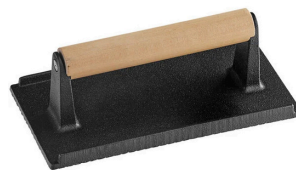
Cast Iron Steak Weight