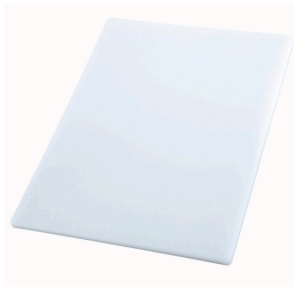
18" x 24" White Cutting Board