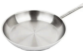
12.5" Stainless Steel Fry Pan