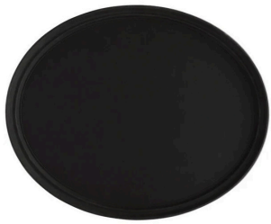
22" x 27" Easy-Hold Tray