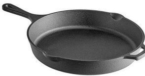
15" Cast Iron Fry Pan