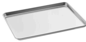
2/3 Sheet Baking Pan